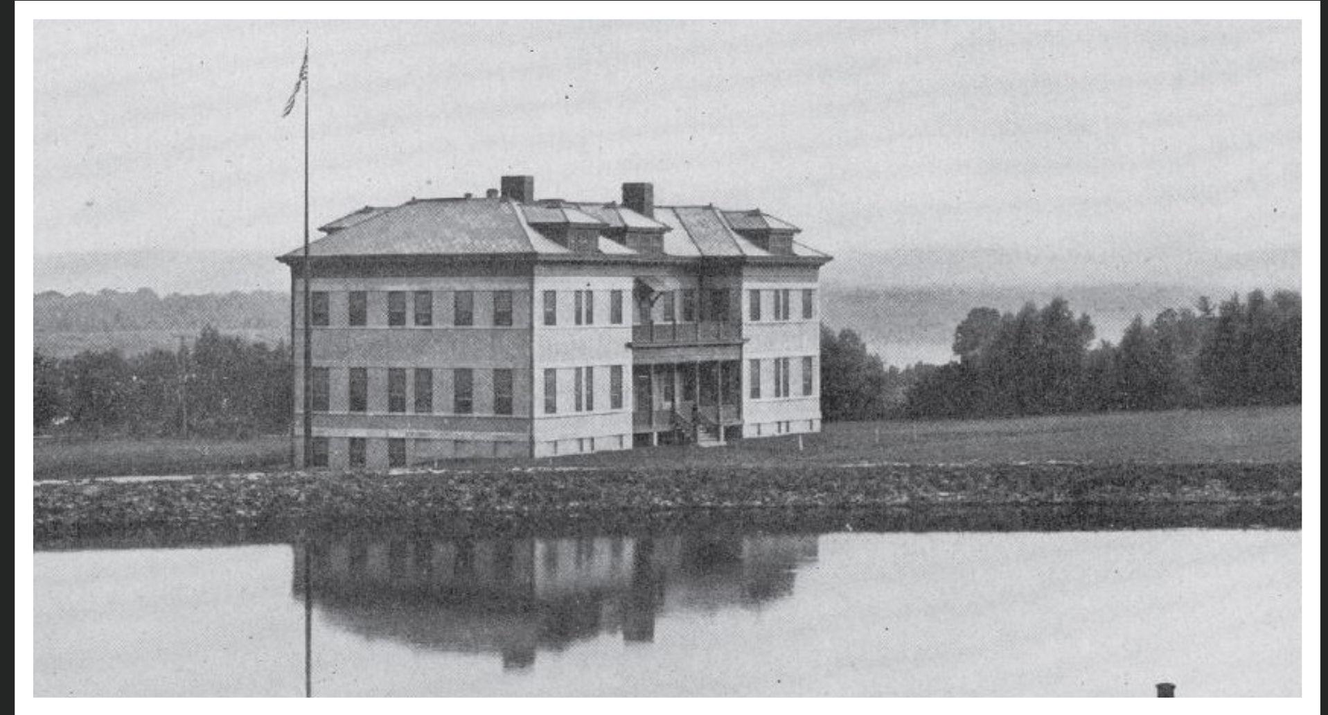
Overview of Main Laboratory circa 1914, facing southwest.

From the mid-1930s until 1945, the Main Laboratory was rarely occupied or utilized. In 1941 the National Youths Administration occupied the building when youths assisted with facility maintenance. In the winter of 1945, officials of the H.J. Heinz company requested the War Manpower Commission to allow them to use German POWs at the plant to alleviate labor shortages. To accommodate the prisoners, the laboratory was converted to a barracks and an 8-foot barbed wired fence constructed around the compound. Between April and November 1945, 310 POWs were housed at the Fairport compound. Although the majority of POWs worked at the Heinz factory, some POWs worked on farms on the "Island" or in canning factories in Wapello. By late November of 1945, the last of the POWs were transported back to Camp Algona. Following their release, some men elected to remain in Muscatine and continued to work at the Heinz plant until their retirement.