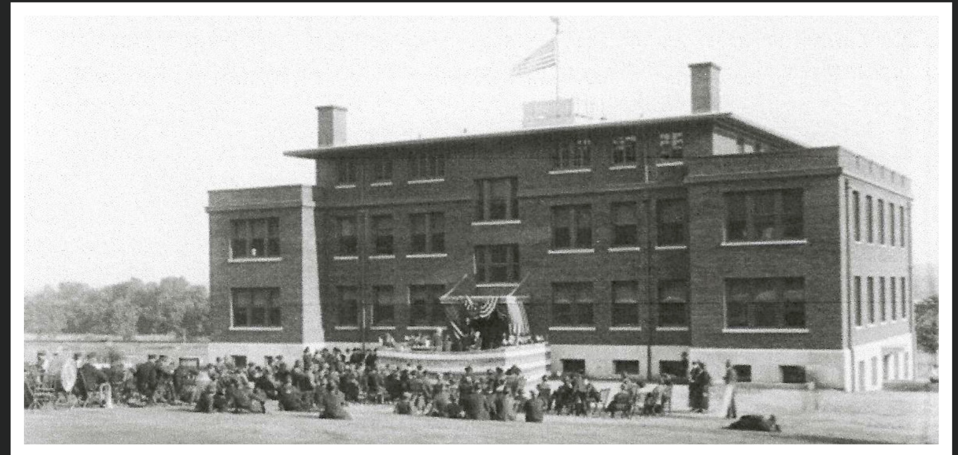
Main Laboratory in 1920 during dedication ceremony, facing southeast.